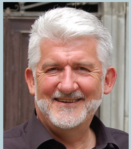
From top to bottom: still life inside Cézanne's atelier; a performance in the Grand Théâtre in July 2023, courtesy Festival d'Aix-en-Provence © Vincent Beaume; tour leader Robert Gay