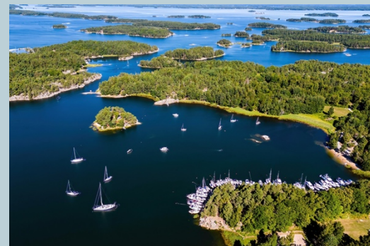
Below, the Stockholm archipelago